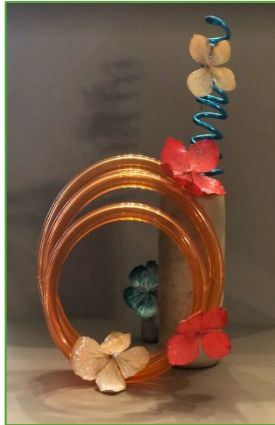
5" x 5" Tubular Petite - Oven-baked clay container, dried hydrangea blossoms painted with nail polish, aluminum wire, orange fuel tubing