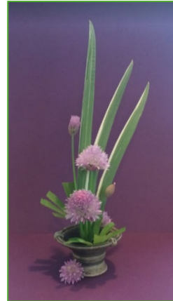
6" x 6" Petite - Pottery container, iris leaves, chive blossoms