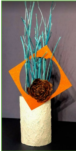
10" by 10" Petite - Painted toilet paper tube, deodar cedar cone, painted sticks, paper shape