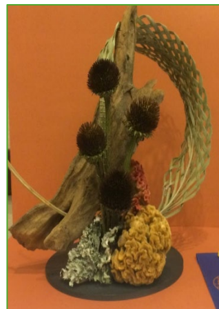
12" x 12" Petite - Driftwood, cone flower seed head, braided palm, lichen , celosia