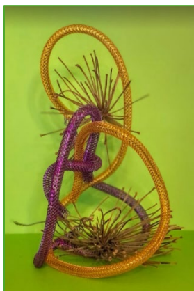
12" by 12" Petite - Dried allium , braided tube ribbon with wire inside